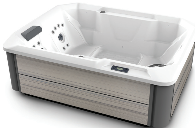
Stride spa shown with Alpine White shell and Almond cabinet.