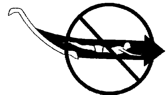
FIGURE M HEAD FIRST