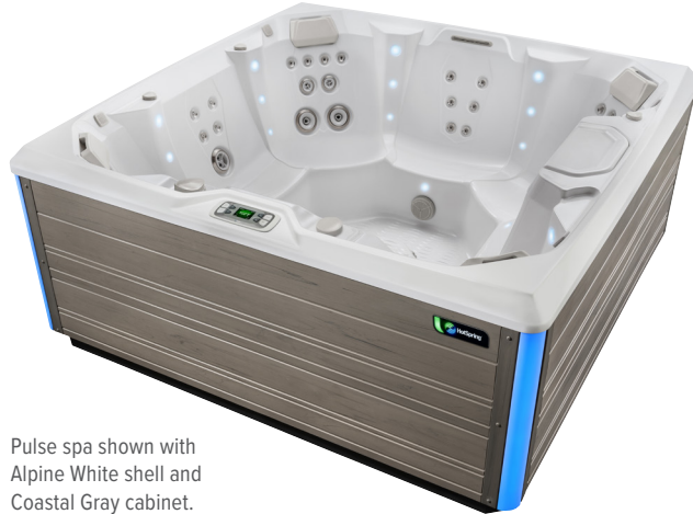
Pulse spa shown with Alpine White shell and Coastal Gray cabinet.