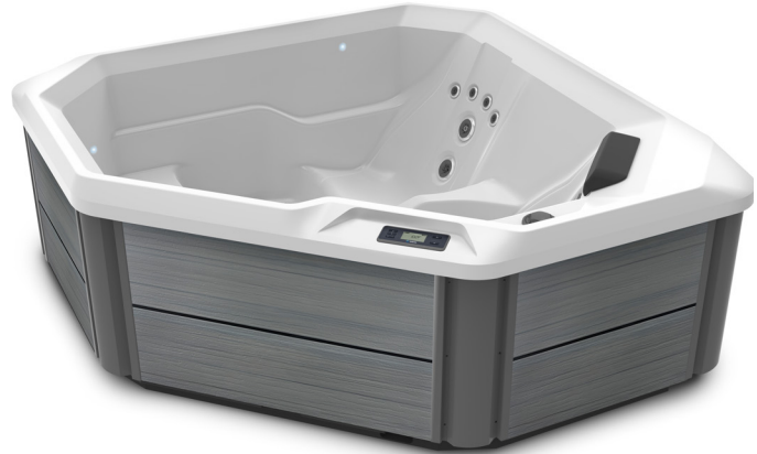
TX spa shown with Alpine White shell, and Storm cabinet.